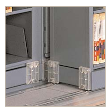
Standard in-rail anti-tip on levelable rail provides stability and durability.