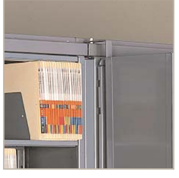
Optional overhead anti-tip provides added stability.*