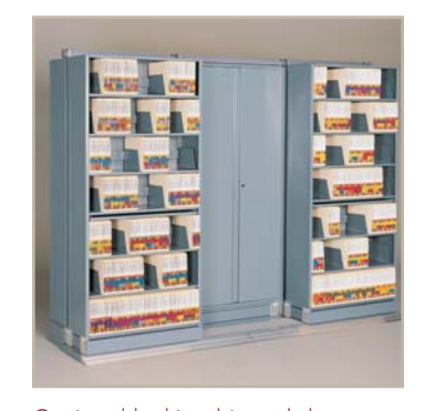
Optional locking hinged doors provide security.*