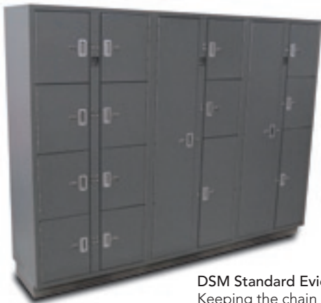
DSM Standard Evidence Lockers Keeping the chain of custody intact with non-pass-thru evidence lockers continues to be crucial when a case goes to trial.