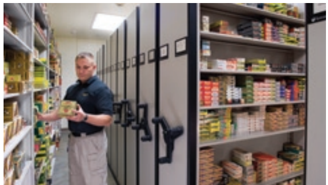
HDMS Systems A mechanical-assist HDMS System stores virtually every kind of ammunition or lab supplies known. This unit features eight-inch-deep custom shelves, versus traditional shelf sizes, to conserve space.