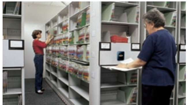
HDMS Systems Open, active case files – kept in StoreFront™ sorter units on the ends of a Spacesaver HDMS System's carriages – can be located and pulled quickly and easily.