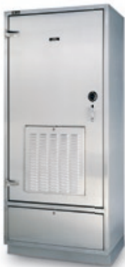
DSM Drying Cabinets Designed for blood and biological evidence, these controlled access drying cabinets provide improved air circulation for safe drying prior to long- or short-term storage.