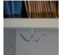
Hook Kits Add single hooks to the side of the modular shelf or a double-hook to the bottom for more hanging storage.