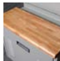
Interlock System All bench and external access drawers automatically lock and unlock with the door. These drawers feature 200 lb. ball bearing slides.