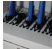
Universal Base Use in conjunction with the EZ Rail or support rail, and with Spacesaver weapons storage components.