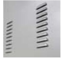
Louvered Doors and Drawers Louvers help direct optimal air circulation.