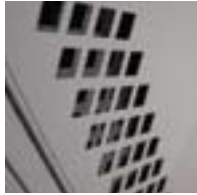
Visibility/Circulation Diamond perforated doors offer visibility as well as natural air circulation and ventilation.