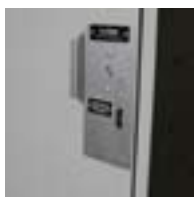
Lock Options Lock options include hasp only for pad lock, keyed lock or combination lock.