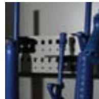
Support Rail Use with Spacesaver weapons storage components or other specialty storage accessories.