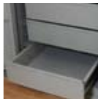
Internal Drawers 6 and 9 inch high drawers offer more custom space, and are available in locking or non-locking configurations.