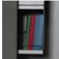
Modular Shelf Available in 12" and 24" heights. Add accessories like the file divider kit to further compartmentalize and customize the locker.