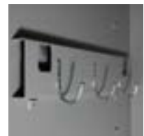
3-Hook Bracket Hook bracket can be moved up and down, and from one side of the locker to another.