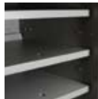
Adjustable Shelf Available in standard and heavy duty capacities for storing everything from clothing to ammunition.