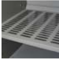
Louvered Shelf For ventilation and drying – great for body armor.