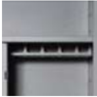
Adjustable Shelf with Integral Garment Hanger Provides clothing separation for better drying.