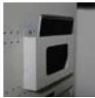
Document Holder Door-mounting allows easy access to documents and notebooks.