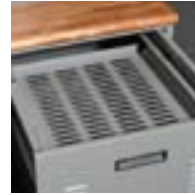
Drying Rack Sliding rack that sits in bench drawer for ventilation and drying.