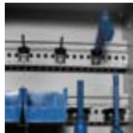
EZ Rail™ Element Innovative engineering offers flexible storage of hanging bins, slat wall accessories and weapons storage components.