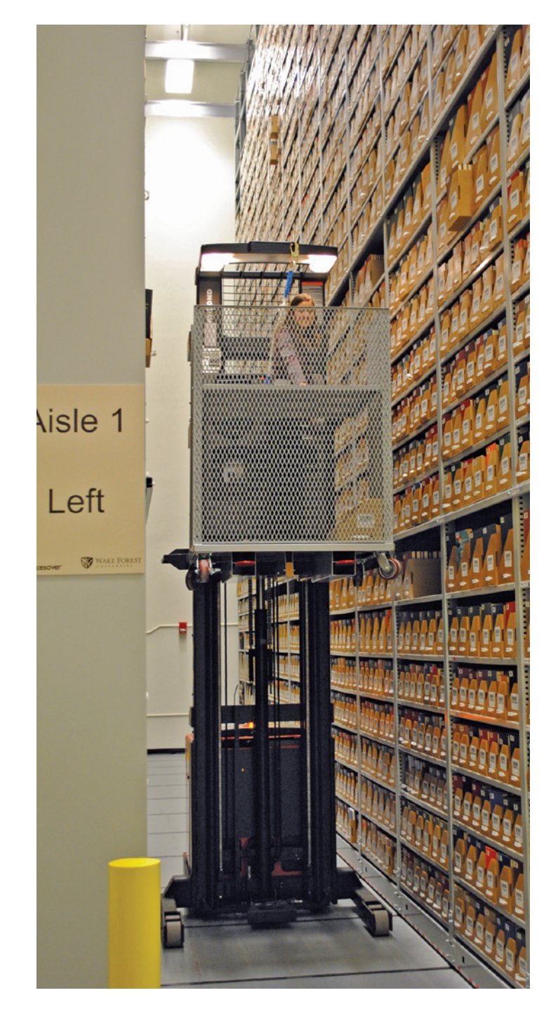
Integrated guide wire: when the bays open up and give someone access to the aisle, the forklift is centered on a guide wire, which keeps it on course. This means a user cannot run off course and into the shelving system.

The Spacesaver XTend Mobile High-Bay solution offered Wake Forest University the ability to grow their storage